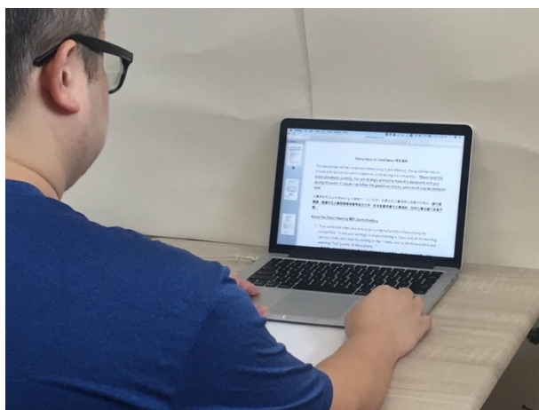
The screen to be displayed by the camera of the Device SIDE 電子裝置 SIDE 的攝像鏡頭所需顯示的畫面

在整個比賽中，電子裝置 SIDE 的攝像鏡頭必須放在適當的位置，以使視頻顯示你的桌面和電子裝置 FRONT 的屏幕 (參閱下圖)。